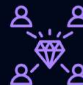
Exhibit your technical skills through live showcases, revealing your proficiency across diverse technologies.